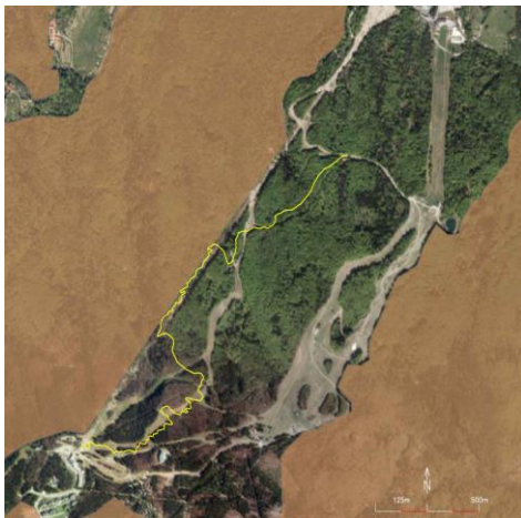
Photo 2: »Red line« route

Project no.: 04/2015 »RED LINE« deals with part of the exiting Bike Park Pohorje trail. It is intended for experienced bikers, primarily on the concept based on positioning on the terrain configuration and incline. It represents the path intended for experienced bikers and extends from the upper cableway station. Initially it runs along the ski slope trail then turns through the woods to the cableway route. The trail runs under the cableway route for some time, then diverts to the forest road. Next it runs parallel to the forest road and is then later connecting to the »FLOW LINE« bike trail. The whole area of bike trail intervention is limited to 0,31 ha. The total length of the trail is 3063,4 m. The highest point of the trail is at 1035 masl and the lowest point is at 532,0 masl. The average drop of the track is 16,5% at the height difference of 504,9 m.