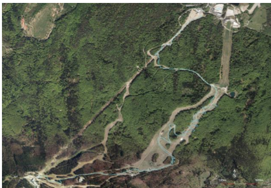
Photo 1: »Flow line« route

The current status of Bike Park Pohorje represents an already established bike trail “Flow line”, that runs on the ski slopes and wooded areas between upper and lower cableway station. The trail runs partially on the edge of ski slopes and partially in the wooded area between the ski slopes. The trail utilizes the natural features of the terrain, such as the longitudinal falls, bumps, rocks and the like. The start of the bike trail is at the highest point by the upper cableway station, the end point is located at the lower station (the entry station) of the same cableway. The whole area of bike trail intervention is limited to 0,54 ha with the highest point at 1043 masl and lowest point at 325 masl - (height difference of 718 m).